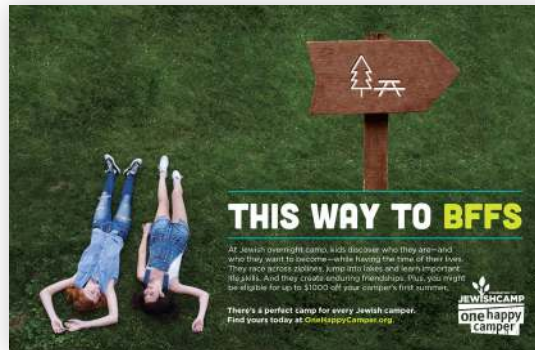
Half-page Horizontal Ad