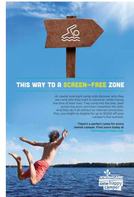
Half-page Vertical Ad