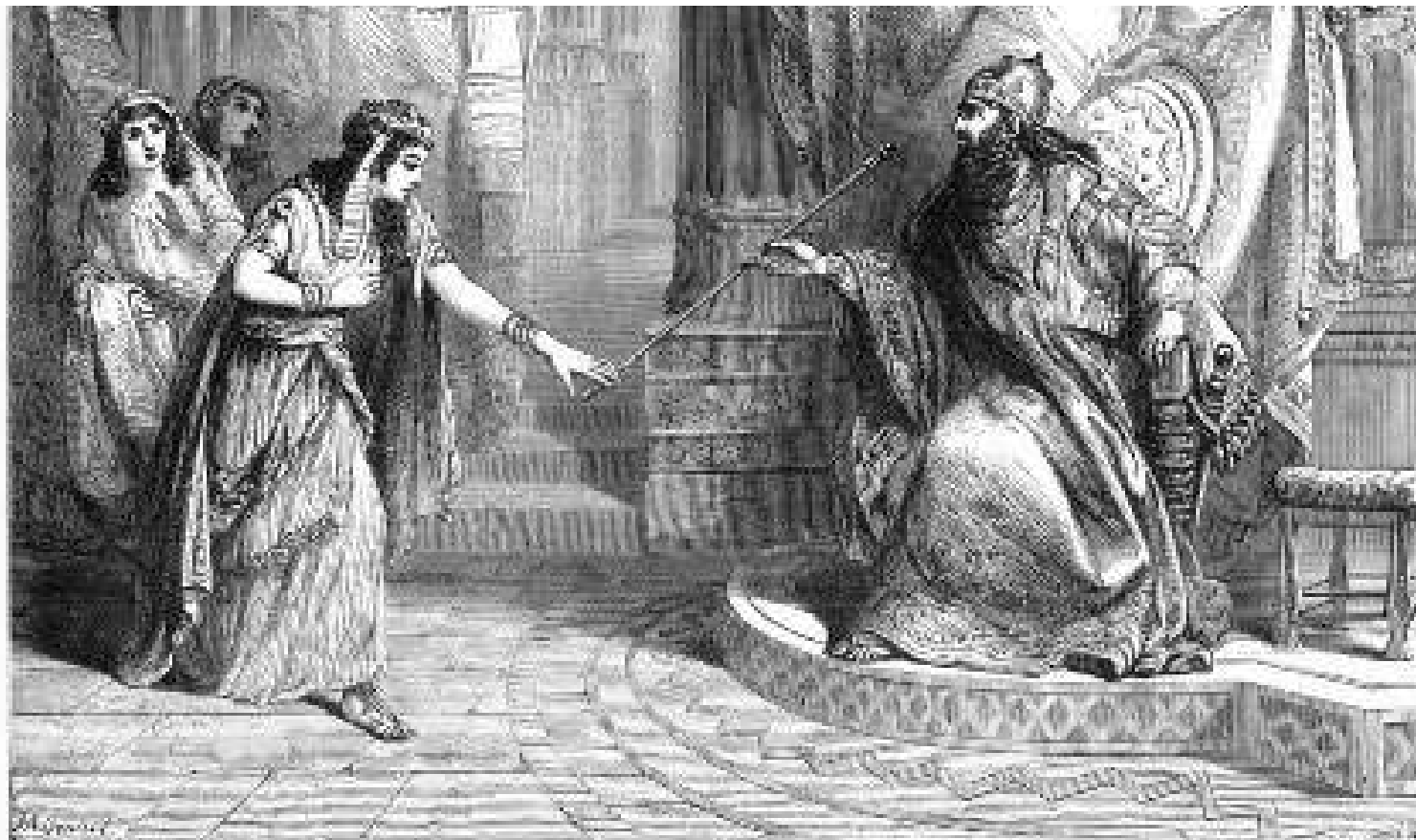
ESTHER BEFORE ACHASUERUS.