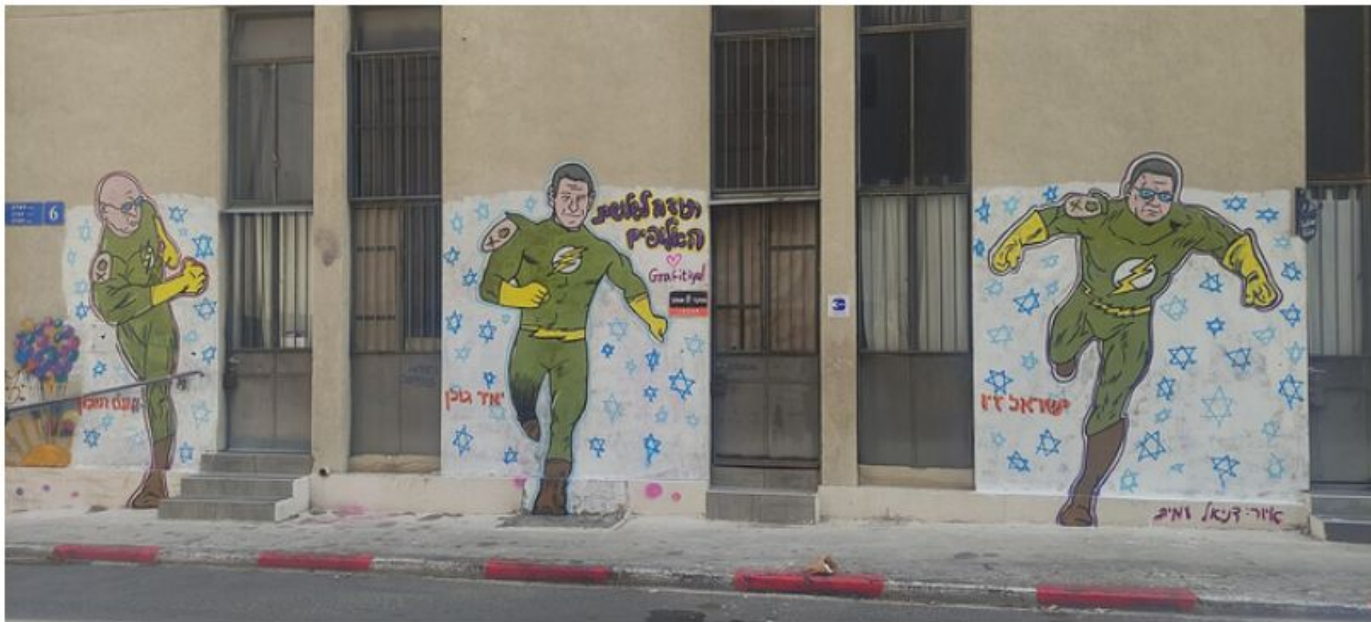
Noam Tibon, Yair Golan, Israel Ziv